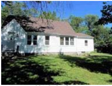
921 Cedar front

Status ACTIVE MLS # 20165509 Address 921 Cedar Street City Cedar Falls House Style 1-1/2 Story Year Built 1945 Total Bedrooms 5 Total Baths 1.00 Total Finished SqFt 1,543 Garage Stalls 2 Stalls